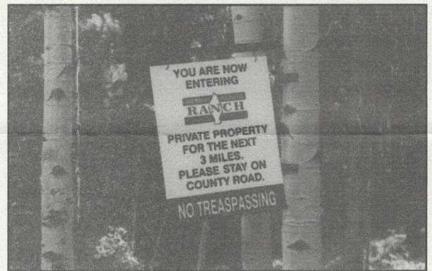
Signs along Moffat Road

2. On June 29, 2000 we drove up the East side. A Gilpin County grader was maintaining the road between Tolland and the East Portal. We followed a Department of Wildlife fish truck up the hill. Travel up the hill is slow due to the many rocks in the road. The grader operator said no work had been done on the road for a couple of years. He was right, expect to drive carefully. Gilpin County did go up to push snow as far as the Needles Eye roadblock above Forest Lakes. We watched as 1000 fish were stocked in Yankee Doodle and 1000 fish in Jenny Lake. The fisherpeople really got busy. We caught five and then came on down.