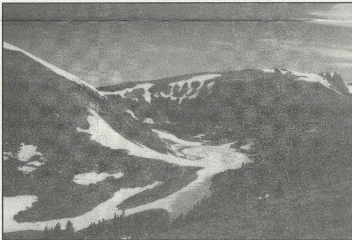
Pumphouse Lake

1. The road up the hill is open on both sides. On June 24th, Nita and I drove up the West side from Winter Park. The road had been graded, some culverts replaced, and was in fairly good condition for a rural mountain road. Of course there were a few stretches where one must drive over rocks. So take it slow! A young camper at Corona was using a small gas stove to make coffee. We really have a FOREST FIRE DANGER due to dry conditions and lack of snow. A large snow drift did block the route from Corona toward the Devil's Slide trestles. But, other than that, there was very little snow. The ice on Pump House Lake was starting to thaw. It was a beautiful clear day and a wonderful drive. Grand County should be commended for the condition of the road.