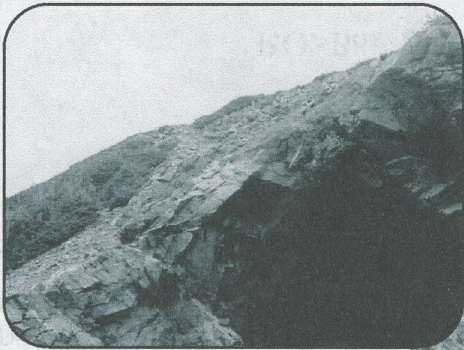
Needles Eye Tunnel from West End, June 29, 2002. Mesh has been pulled from hillside by freeze-thaw of snow as it melts then freezes at night. Rocks have fallen, others are held in the mesh above the road.