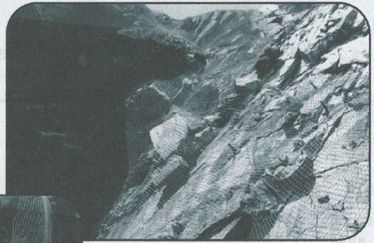
Mesh above road with rocks held to provide safety. These rocks should be released before they exceed strength of mesh.