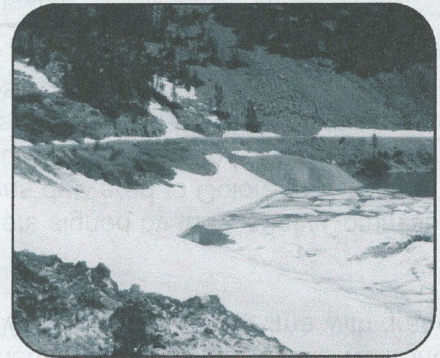
Yankee Doodle Lake