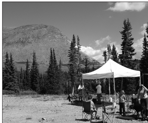
Beautiful weather at the Rollins Pass Annual Picnic with 41 members attending