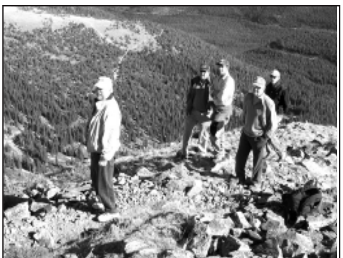
Boulder County Commissioners inspect the Devils Slide Trestles and the top of the Needle's Eye Tunnel.

Since that time no additional rock has fallen in the tunnel. It is time that we get Boulder County to step up to the plate and work with us in making this dream a reality.