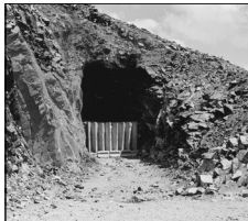
Needle's Eye Tunnel, East Portal