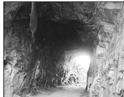
Needle's Eye Tunnel, Wire Mesh is doing it's job!