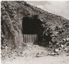
Needle's Eye Tunnel, East Portal