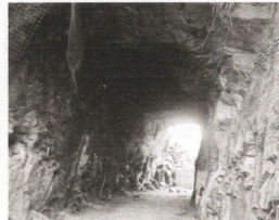
Needle's Eye Tunnel, Wire Mesh is doing it's job!