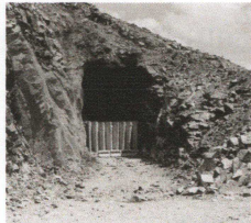
Needle's Eye Tunnel, East Portal